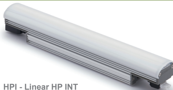
HPI - Linear HP INT

The EcoSpec® Linear Frosted Lens accessory is a snap-on diffused lens that provides a soft effect. It snaps easily onto the Linear INT or Linear HP INT products, either before or after installation, for quick infield design changes. The lens is ideal for applications where the fixture is visible and LED glare needs to be reduced