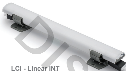
LCI - Linear INT